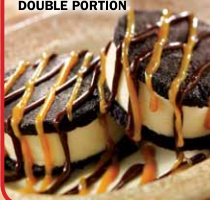
OREO MADNESS, DOUBLE PORTION